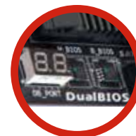
Gigabyte has equipped the board with a pair of physical BIOS ROMs.