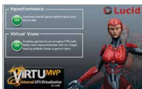
The Virtu MVP utility features Virtual Vsync and Hyperformance.