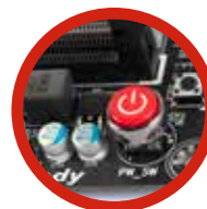
Onboard switches are situated just above the board's DIMM slots.

The GA-F2A85X-UP4 is also bundled with LucidLogix Virtu MVP. With switchable graphics as its key offering, this utility enables users to dynamically switch between onboard graphics and a discrete graphics card depending on the system's workload. This capability is useful when one's into gaming or content creation.